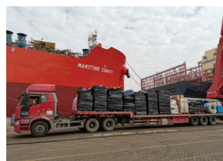
NB initial supply for MT Torm Splendid in GSI yard.