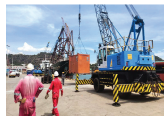
Offshore delivery for Normand Oceanic at Shekou