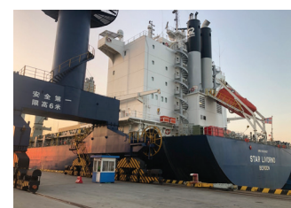
Spare parts delivery for Star Livorno at Changshu