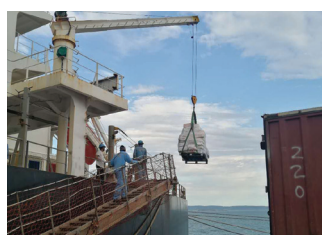
Running vessel supply for Eckert Oldendorff at Huangpu